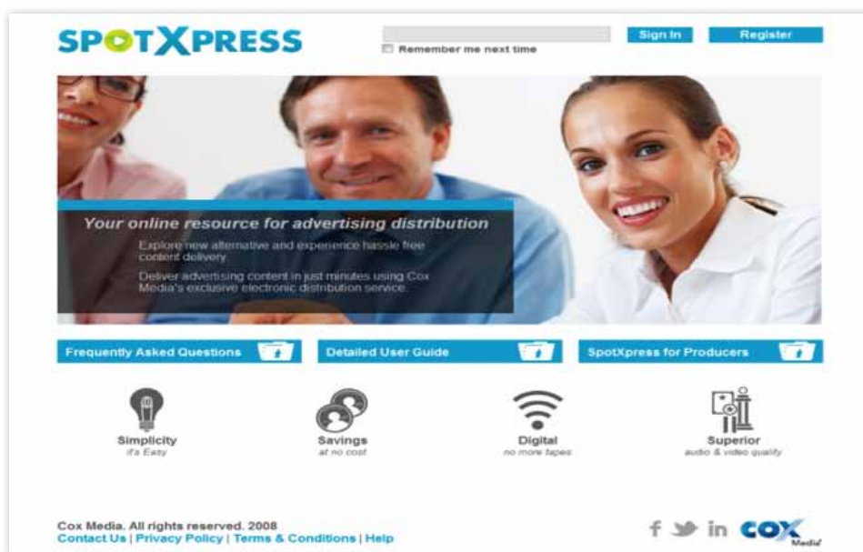
Figure 2.2a: SpotXPress Home Page