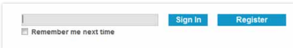
Figure 4.1a: Sign In Home Page

4.1. Log on to SpotXPress by entering your e-mail address and clicking Sign In.